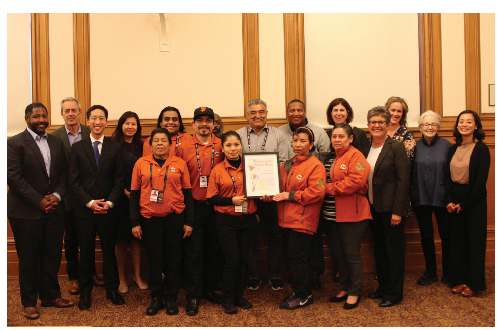
Awardee, SF Giants