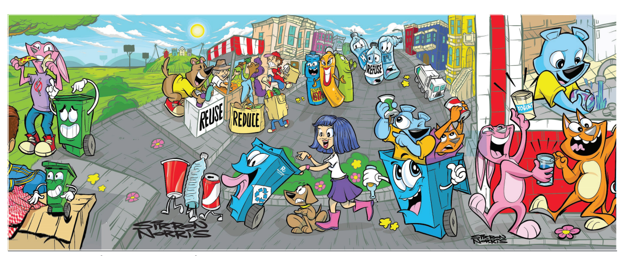
2019 Commission on the Environment Annual Report

Urged the Mayor and Board of Supervisors to adopt File No. 190974, an ordinance amending the Green Building Code to require newly constructed buildings in San Francisco to either use electricity as the source of energy for all building systems and exclude natural gas or to significantly improve energy performance if any systems utilize natural gas (Resolution File No. 2019-09-COE).