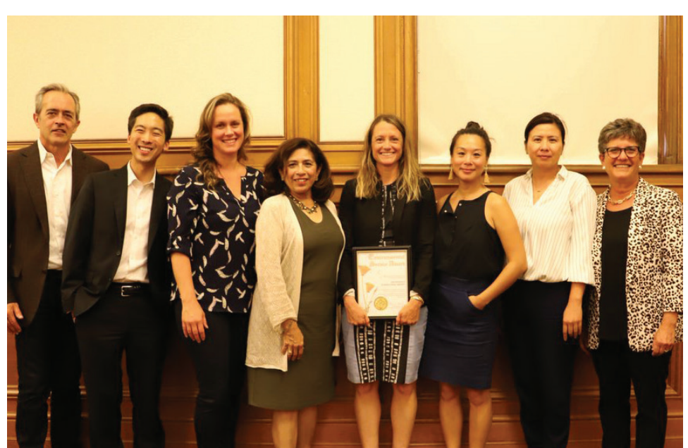
Awardee, San Francisco International Airport